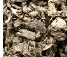
Sugar Beet Pulp