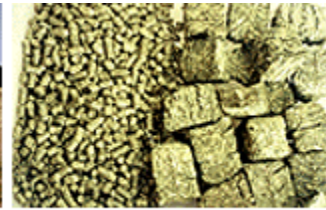
Alfalfa Cubes and Pellets