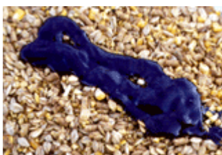
Molasses on Sweet Feed