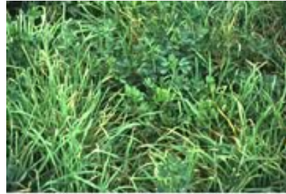
Alfalfa and Orchard Grass Mixed Pasture

Proteins are made up of linked amino acids. They serve as structural components for muscle and ligaments in the body and are a source of energy. There are 22 amino acids that are needed by the horse, but not all of them have to be provided in the feed (table below). The non-essential amino acids are produced in the body tissues and therefore not needed in the diet. However, the essential amino acids must be provided in the diet or synthesized by the microorganisms in the intestine. A protein is quantified by the nitrogen content of the feed and is classified as high quality if it contains a high amount of essential amino acids. The amount of protein required in the horse's diet depends on the digestibility of the diet and the individual horse's protein needs. In growing horses, the only essential amino acid that may be limited in normal diets is lysine. It must be provided as 5 to 6 percent of the total protein in the diet.