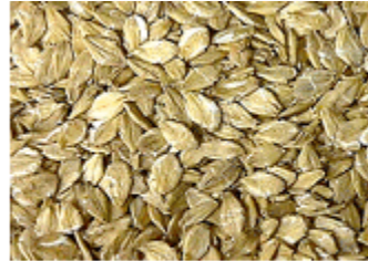
Steam Flaked Barley