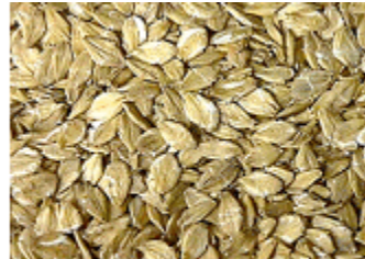
Steam Flaked Barley